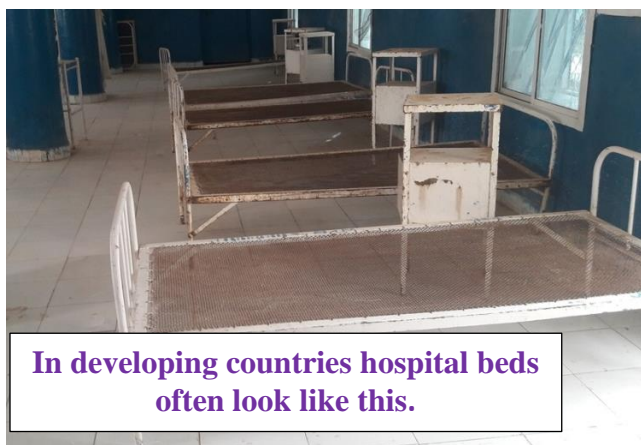
In developing countries hospital beds often look like this.

The Adopt a Bed Program is one of the easiest and most cost effective International Projects your Club can adopt.