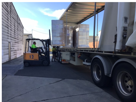
Andy loading pallets of For-a-Meal with the forklift.

DIK has again been the focal point for more aid to Ukraine. These photos show the last loading of 17 pallets of warm clothing, shoes, medical supplies and "For a Meal" packs ready for transport to Amberley Air Force base in Queensland before being flown to Europe. The pallets have been assembled at the DIK store over the past month.