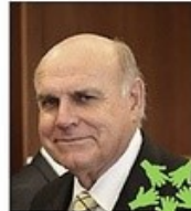
Bob Glindemann, OAM

Lord Mayor of the City of Melbourne. A champion of multiple sustainability initiatives to ensure Melbourne remains one of Australia's most sustainable cities.