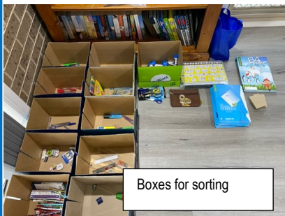
Boxes for sorting