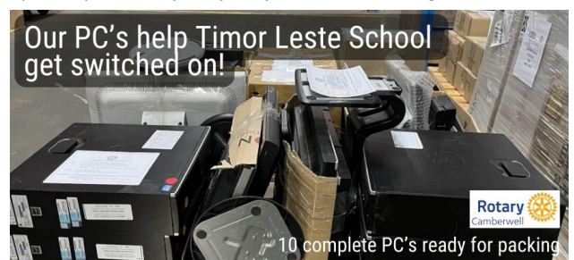
10 complete PC's ready for packing

The freight charges were met by the Catholic Diocese of Darwin. 10 PC systems ready for pallet wrapping (cling wrap!) at the Donations in Kind facility, West Footscray.