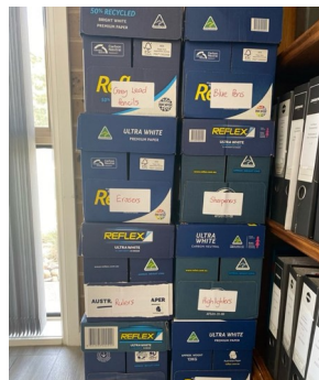
Stationery ready to deliver to DIK – treasure!